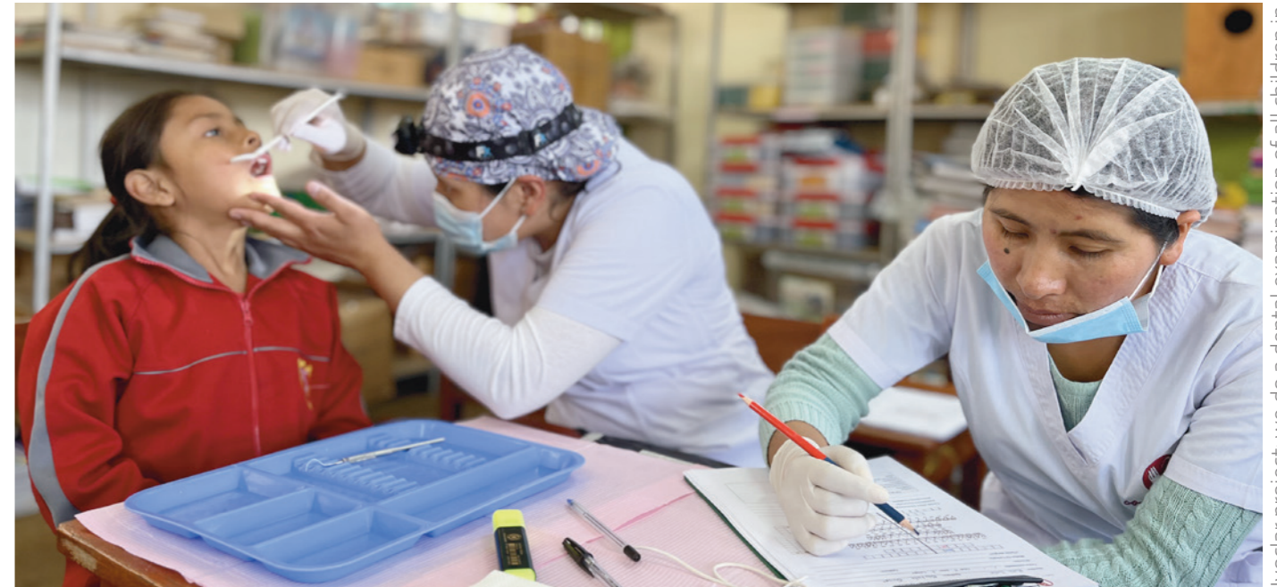
Ivoclar project: we do a dental examination of all children in a school in Cusco.

This beautiful project is new and we have implemented it in the month of August 2023. Thanks to the NGO "Pietro Ruggeri" who are interested in contributing to a healthier world through nutrition, we were able to make the dream of many parents come true. Anemia is a public health problem in Peru. According to the government, its prevalence in children between 6 and 35 months is 40.9%, a figure that is equivalent to approximately 700,000