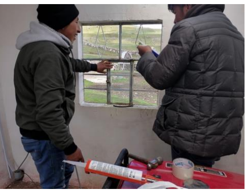
Installing a glass for the window to protect our generator from the harsh weather.