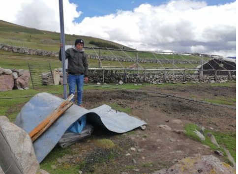
Building the new structure for the greenhouse.