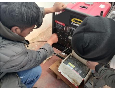
Maintenance work to our power generator. Giving some love to our machine that saves us from interrupting our activities when there is not power.