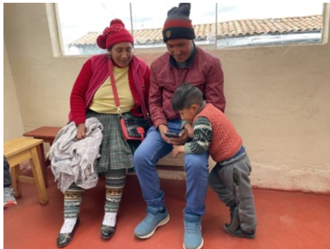
We love welcoming this family. They have received many Health Promotion talks.