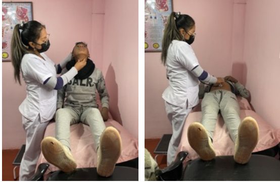
The doctor examining a patient with sore throat and stomach problems